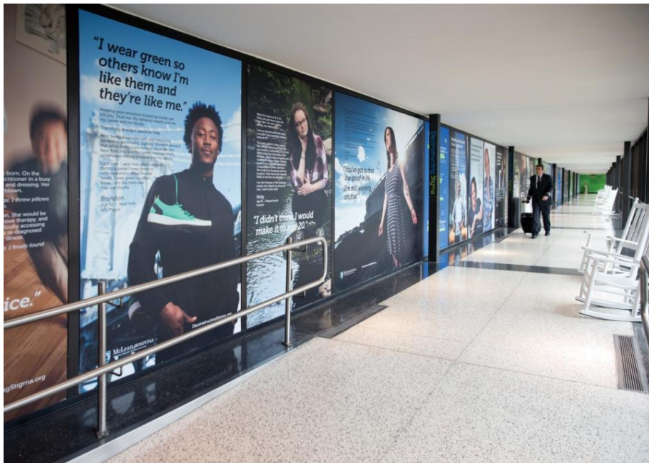
The 235-foot gallery located Boston Logan Airport between Terminals B and C features more than 30 portraits of people living with mental illness, including celebrities such as Howie Mandel and NFL star Brandon Marshall.

Partners HealthCare's filing of Form 990 on McLean's behalf includes the URL to the implementation strategy on the McLean website.